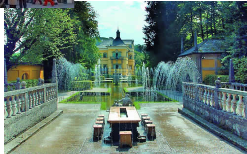
EMLG-JMLG Meeting 2009, 6th – 10th September 2009, Salzburg - Austria